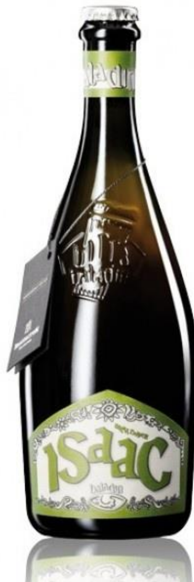
Baladin Isaac 5% ABV Italian Craft Beer $13.9 330mL bottle

Italy it typically known for it's pale, inoffensive lagers. However, scratch that surface and there's interesting things to be found. Like brewer Matterino 'Teo' Musso's Piozzo-based Baladin in the northwest of Italy, halfway between Turin and Nice.