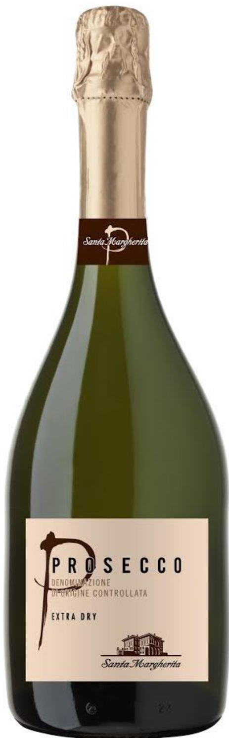
Santa Margherita Prosecco Extra Dry DOC Valdobbiadene, Italy $14.9 / gls | $59 / btl

Lingering streams of tiny bubbles usher in subtle aromatics of flowers with pear and peach like white fleshed fruits. Stimulating freshness, full bodied, elegant palate brings out the long lingering suite of subtly nuanced aromatics